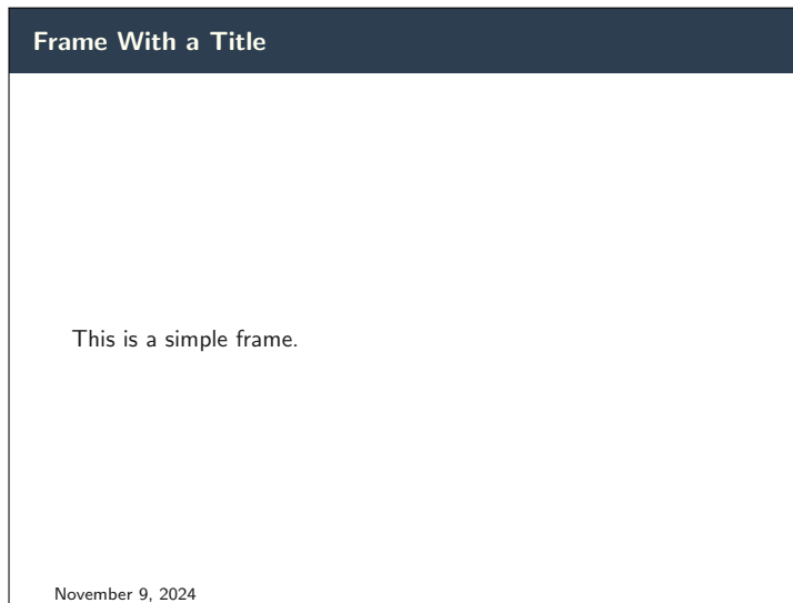
Figure 1: A simple example.

For best results, we recommend installing the fonts Fira Sans and Fira Mono and compiling with Gotham using XeLaTeX or LuaTeX. These are optional dependencies; Gotham is compatible with (e.g.) pdfL A T E X and will fall back to standard fonts if Fira Sans or Fira Mono is not installed.